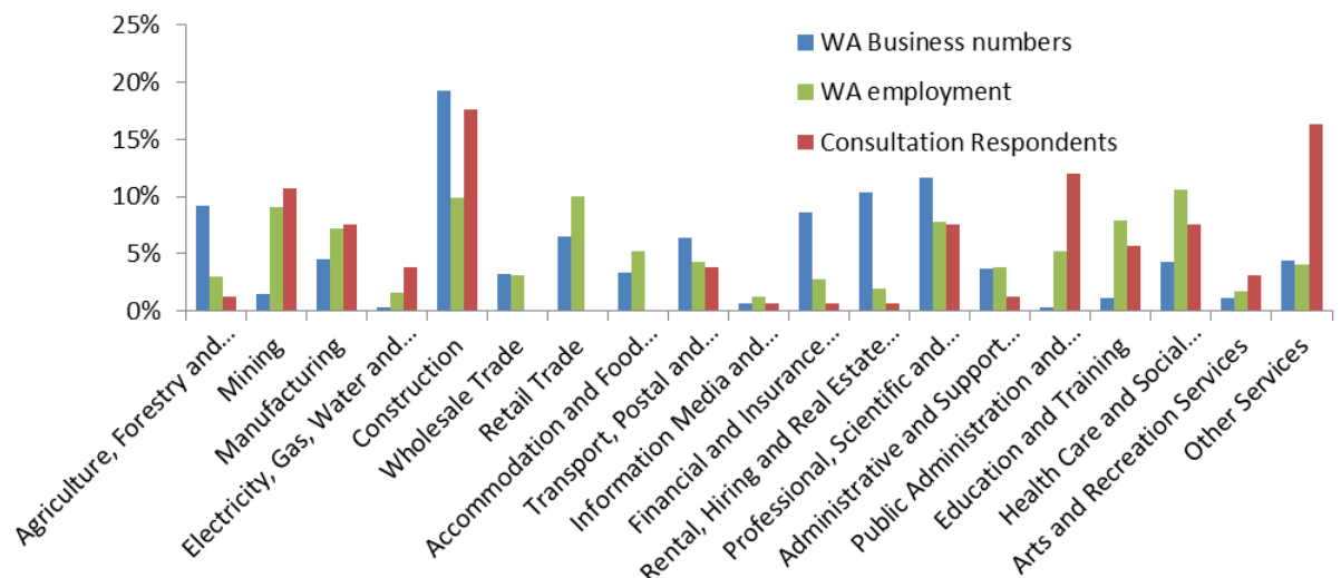
Figure 2: Comparison of WA industry profile by business numbers and employment with consultation respondent profile by industry